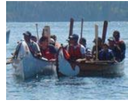
Tribal Journey 2008