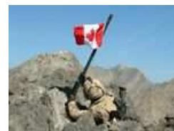
Remembrance Day 2008