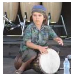
Friendship Festival 2008