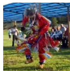
The Keepers Of The Water Conference