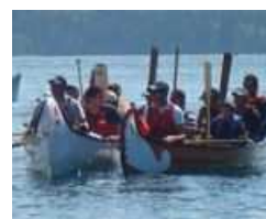
Tribal Journey 2008