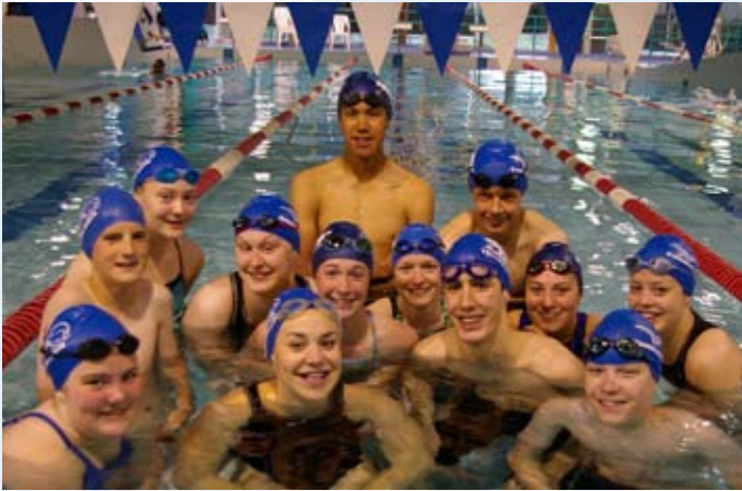
2008/2009 Polar Bear Swim Club Competitors